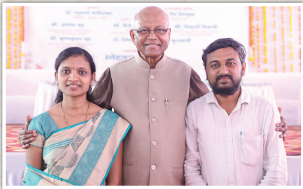
Padmashree, Padma Bhushan Dr. Raghunath Mashelkar