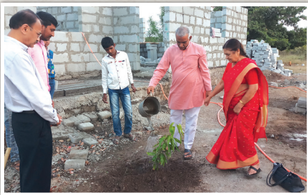
Padmashree Dr. Prakash Amte and Manda tai Amte